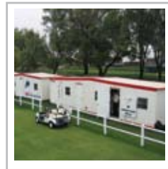
projects & events